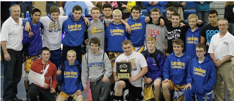
Lawton Wrestlers Win Home Invitational