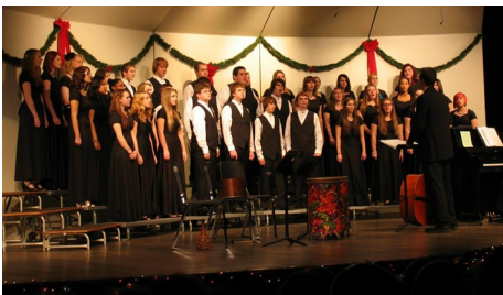
Lawton Choir Holiday Concert